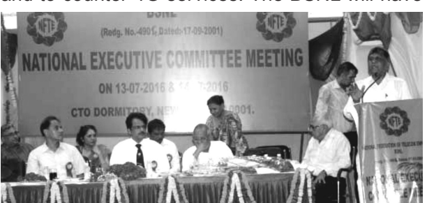
General Secretary addressing the open session

could not get support from Govt but in 2013 BSNL started revival process. In 2016 we have installed 21000 BTS and will be installing 25000 BTS this year. He also informed about the future plan for improvement of mobile network, core network and to counter 4G services. The BSNL will have